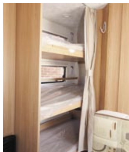
Three bunks stacked neatly into a corner

We understand times are hard and stripping kit to keep prices competitive is a necessary evil. But putting a smaller fridge in a four berth isn't as bad as doing the same in a six. I just feel for such a potentially capable tourer, there has been a little too much removed. That said, the amount of space for the price in this Altea puts it ahead of most of its competitors. ■