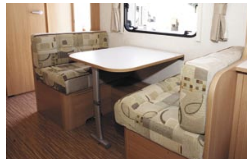
The offside dining area - enough space for four children to sit here

Price: £10,999 Axles: 1 Berths: 6 MRO: 1085kg MTPLM: 1300kg Width: 2.29m Overall length: 7.23m Headroom: 1.95m