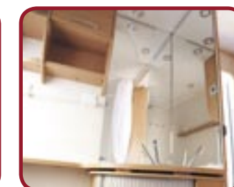
The washroom may be a unitary design but it's up to the job of providing enough washing space