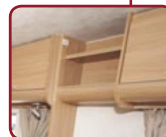
Two useful shelves interrupt the unobtrusive locker run - and the lockers have positive catches